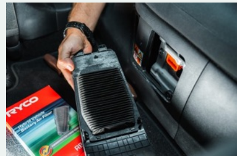
STEP 5A Once flap is released, remove old battery filter by releasing the filter from the tabs holding it in place by pulling away from OEM housing flap. Then install new battery air filter in same orientation as old filter was installed.