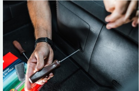
STEP 2 Using phillips head screw driver, unscrew and remove screw.