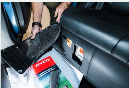
STEP 5B Once flap is released, remove old battery filter by releasing the filter from the tabs holding it in place by pulling away from OEM housing flap. Then install new battery air filter in same orientation as old filter was installed.