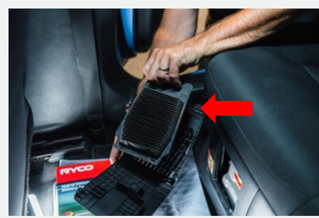
STEP 6 Repeat above steps in reverse to re-install OEM battery air filter housing flap.