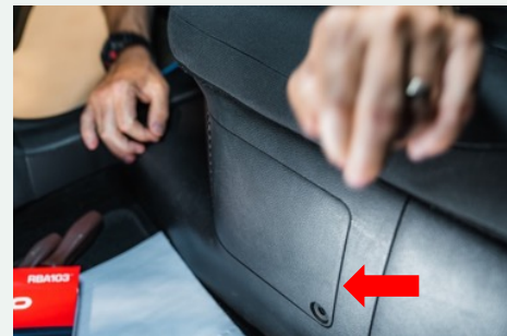
STEP 4A Using flat head screw driver or hands, wedge in-between around perimeter of battery filter OEM housing flap and back seat to begin removal of housing flap - then gently pull open flap to release remaining tabs.