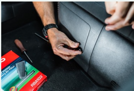
STEP 3 Remove locking clip that was held in by phillips screw.