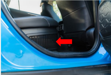
STEP 1 Location of battery air filter is on drivers side, underneath rear passenger seat.

TOYOTA COROLLA ZWE211R HYBRID (2ZR-FXE ENGINE) 08/2018 - 09/2022, LEXUS UX250H MZAH10R HYBRID (M20A-FXS ENGINE) 08/2018 .. / ON