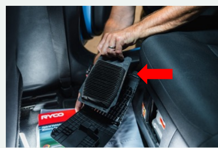
STEP 6 Repeat above steps in reverse to re-install OEM battery air filter housing flap.