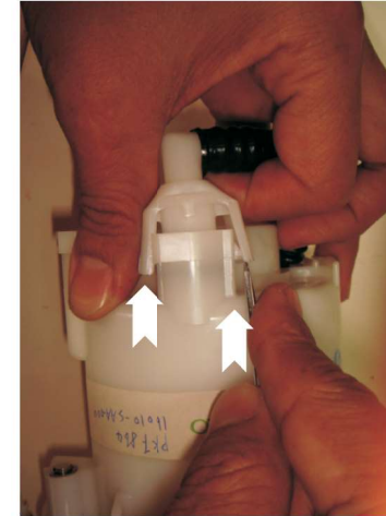
3: Undo 2 clips using small screwdriver and remove adaptor.