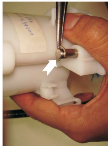
7: Push filter towards top of assembly and remove 2 circlips using needle nose pliers .