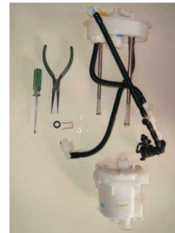
8: Diss-assembled filter assembly.

Reassemble in reverse order using new parts as packed with filter.