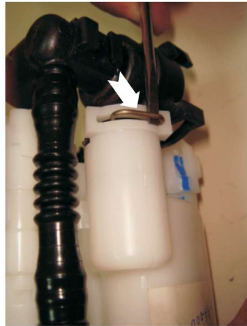
1: Use screwdriver or needle nose pliers to remove wire clip