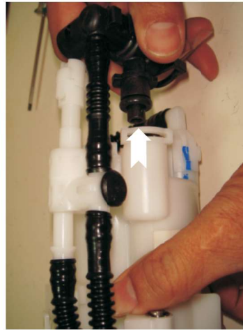
2: Pull connector up to remove from body