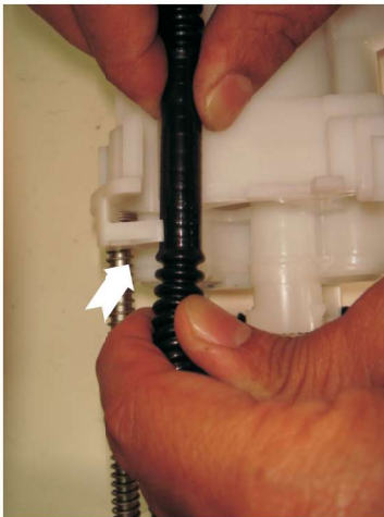
5: Remove fuel line from clip.