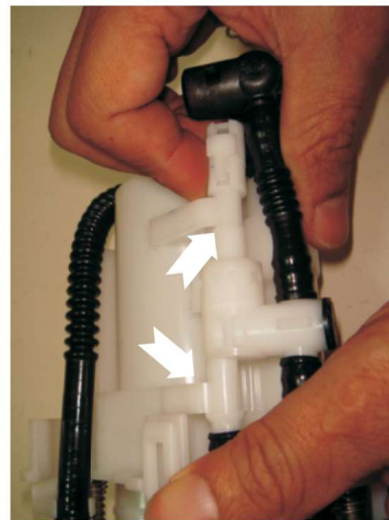
6: Remove tube from clips.